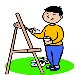
After school care is reimbursable

These funds may be used to pay for qualified dependent care expenses. The untaxed dollars you spend on dependent care may yield 40% or more in savings, depending upon your tax situation.