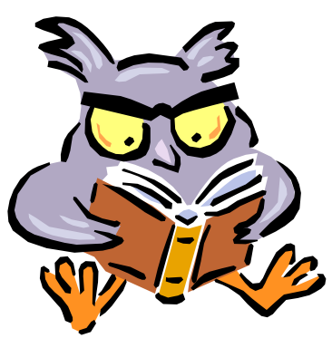
Choose wisely when estimating your expenses

Working parents can benefit from a Dependent Care Assistance Plan (DCAP). Child care can be very expensive.