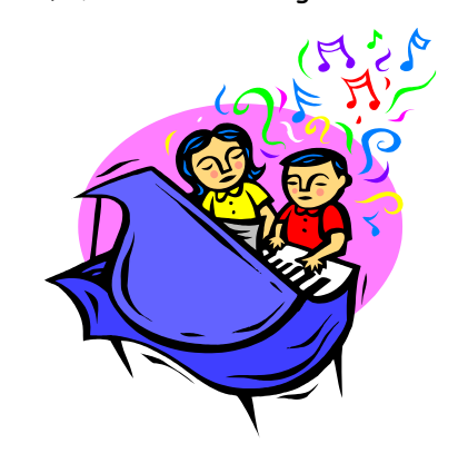
Care for a disabled adult may qualify as an eligible expense

return (or could have been claimed, except for the fact that he or she had $3,050 or more of gross income).