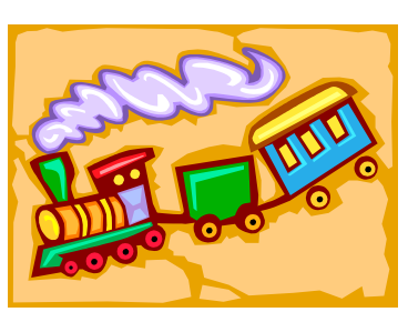
Your contributions are deducted free from (most) taxes

As you have eligible expenses during the